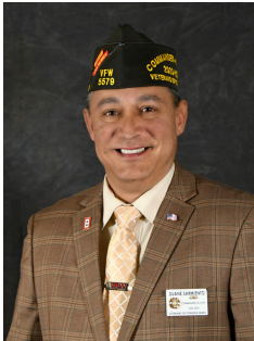
VFW National Commander-in-Chief Duane Sarmiento Post 5579 Navy