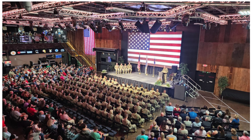
323rd CBRN Company's activation ceremony at the Alliance