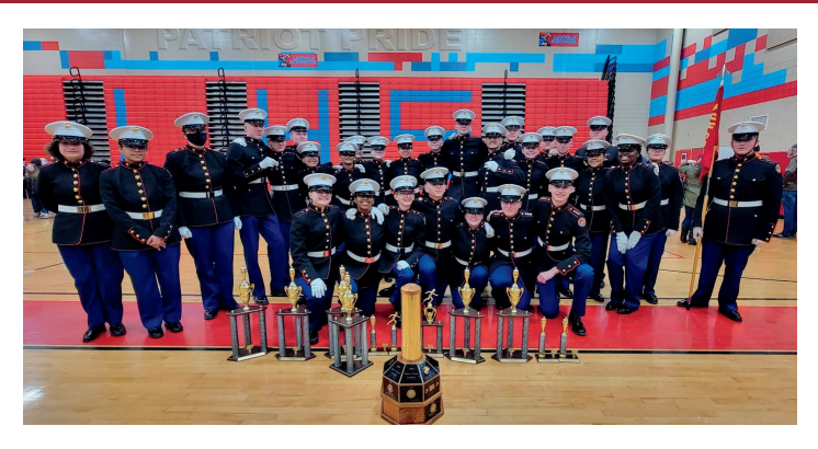
Lincoln High School Marine Corps JROTC Cadets pose with their 1st Place Overall and other wining trophies.